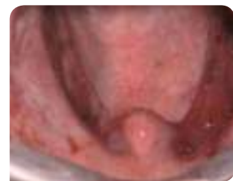
Wound immediately after tonsillectomy. Wunde unmittelbar nach der Tonsillektomie.