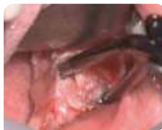
Tonsillar Dissection. Präparieren der Tonsille.

Tonsillectomies can be performed very quickly with little, but precise and effective bipolar coagulation while most of the dissection is “cold” or “blunt”. The glossopharyngeal nerve can be identified and spared. 1