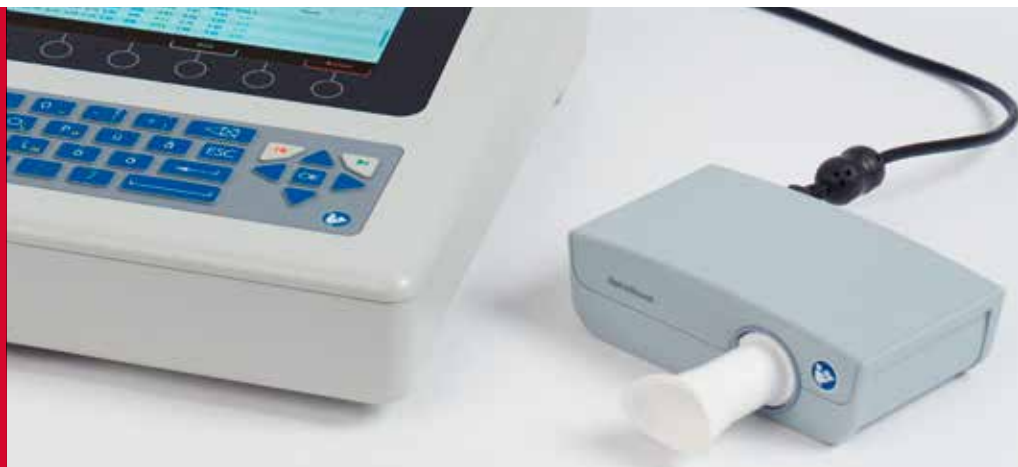
SpiroScout SP plus, for spirometry tests with the CARDIOVIT AT-102 G2